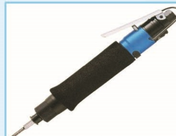
STRAIGHT HANDLE LEVER START SHUT-OFF SCREW DRIVER

SQUARE DRIVE : 1/4" FREE SPEED (R.P.M.) : 7500 MAX TORQUE: 200 NM (148 FT-LB) BOLT CAPACITY : 10-12 MM OVERALL LENGTH : 190 MM AIR INLET : 1/4" PT AIR HOSE : 3/8" I.D. NET WEIGHT : 2.6 LBS (1.2 KGS)