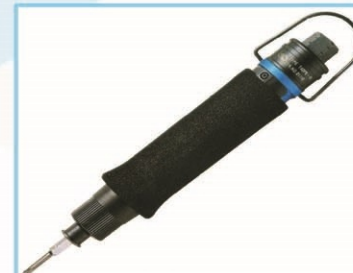
STRAIGHT HANDLE PUSH START SHUT-OFF SCREW DRIVER